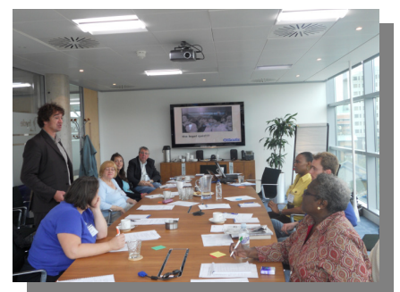
Residents carry out an Equality Impact Assessment